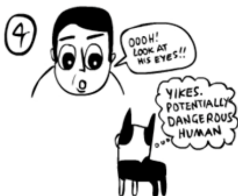
DON'T Stare him in the eye (This is an adversarial gesture)