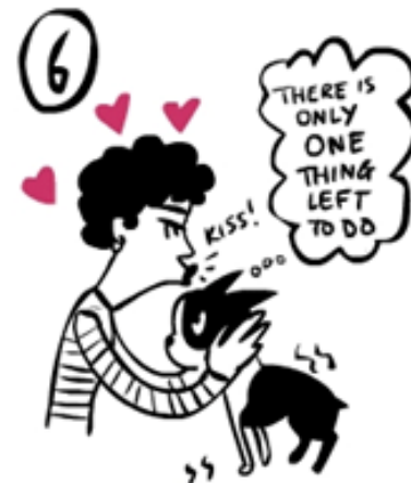
DON'T Grab his head and kiss it (This is an invasion of space)

Doing this to a dog who doesn't know you is like a perfect stranger giving you a great big hug and kiss in an elevator. Wouldn't that creep you out? And wouldn't you have the right to defend yourself?