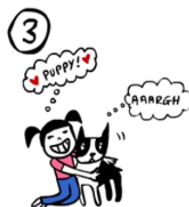
DON'T Grab or Hug him